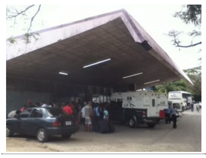
Costa Rica Immigration

Once you get back on the paved road veer right and drive half a km to the blue immigration building. There is a connected restaurant and bar. Park under the overhang.